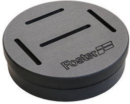
Knives-holder 8100 030